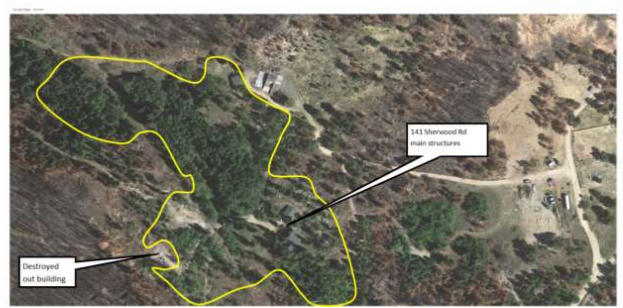
Figure 4. 141 Sherwood main structures (house and detached garage) and surrounding unburned vegetation perimeter. Burned area includes out building destroyed as a suspected result of ember ignition. The structure directly to the north of the 141 Sherwood property was also lost in the fire.