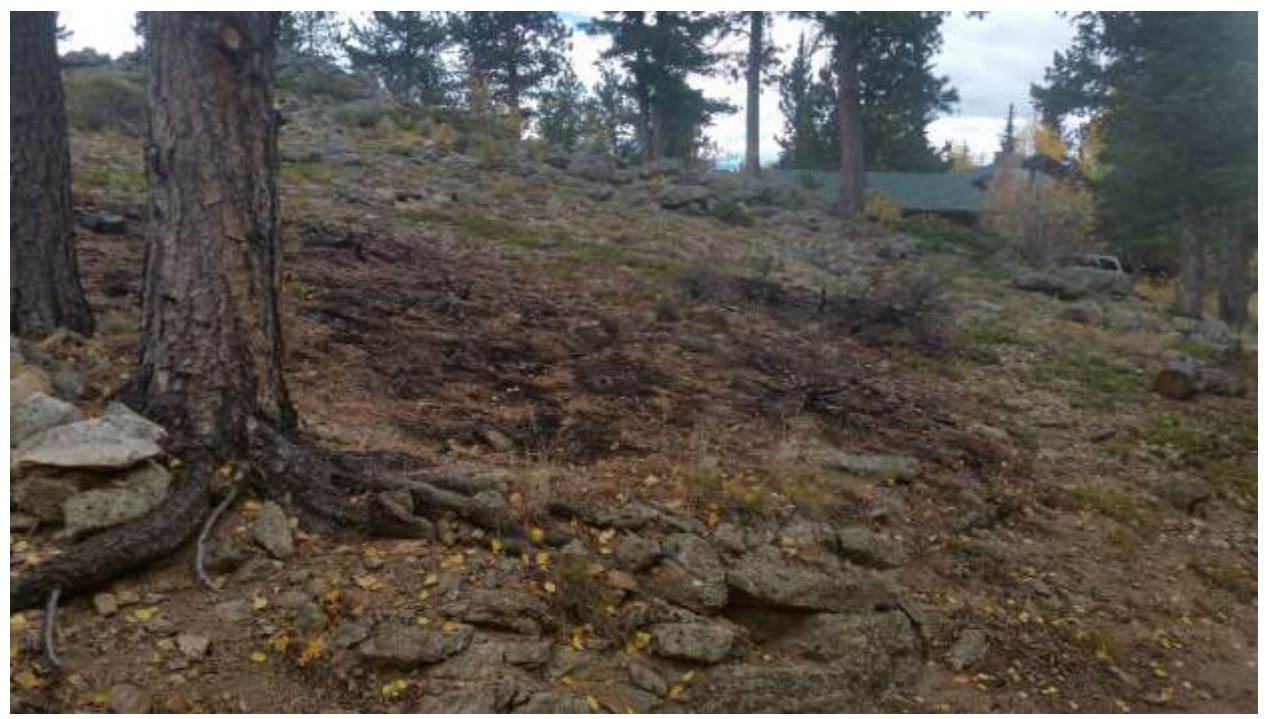
Figure 8. Evidence of the closest backing fire impingement from the northeast at 55 feet