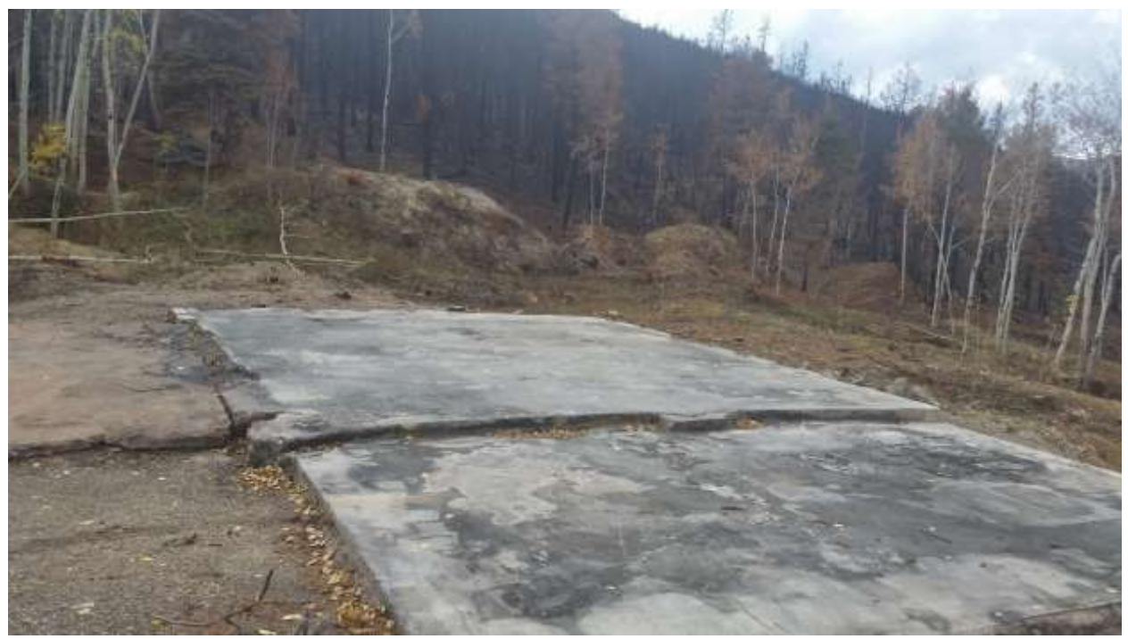
Figure 3. Foundation of an out building, located approximately 315 feet to the southwest of the main structures and 70 feet to the northeast of crown scorched trees, destroyed as a result of suspected ember ignition.

All burn indicators suggest that the central portion of the property was initially largely exposed to a flanking and backing fire only and not the head fire (Figure 2). Secondarily, the fire turned to an easterly/south easterly direction, further exposing the property to a flanking and backing fire. Witness accounts describe airborne ember activity in the immediate vicinity of the main structures during this fire spread event; however, the closest evidence of successful ember ignition is at 36 feet southwest of the main structure in light matted grass and surface litter (needles and small twigs), where minimal spread occurred (maximum 1 foot in diameter) and self-extinguishment without firefighter intervention occurred (Figures 4 and 5). Ember ignition also occurred at a distance of 80 feet southwest of the structure, where remaining vegetation and juniper shrub were ignited and wooden fence posts were consumed as the resulting surface spread uphill (southeast) and away from the main structure (Figures 4 and 6). The wood post and rail fence did not sustain damage beyond the sections immediately adjacent to heavier vegetation (tall grass and juniper shrub) and self-extinguished without firefighter intervention did occur. An existing firewood pile (considered highly combustible) located at 30 feet to the northwest of the main home and detached garage, and approximately 200 feet from the closest crown fire activity did not show evidence of ember ignition (Figure 7).