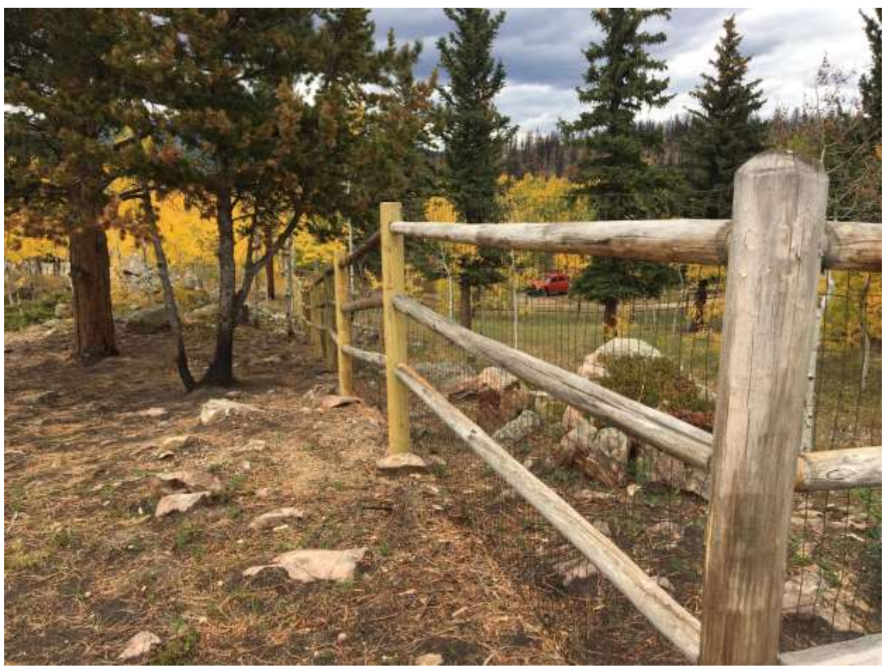
Figure 6. Evidence of Southwest ember ignition (80 feet from the main structure) and resulting uphill fire spread (away from the structure to the southeast) in tall standing grass and juniper. Fence in the photo is the replacement fence.