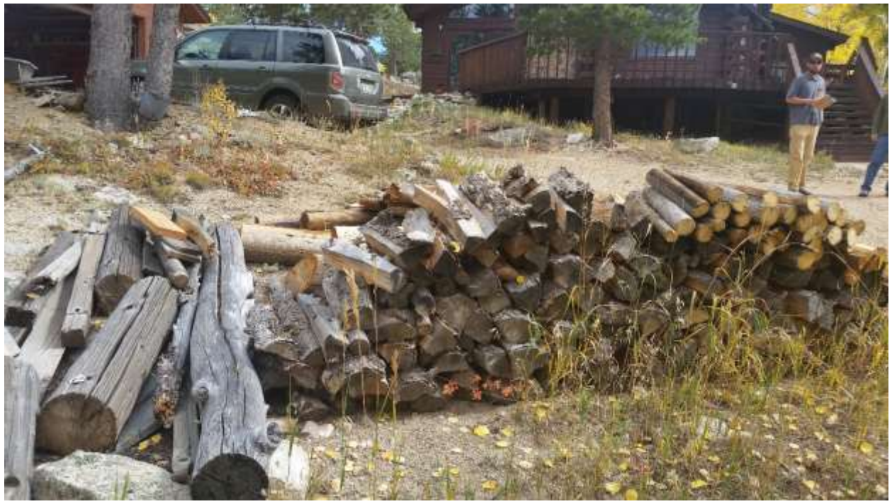
Figure 7. Firewood pile located at 30 feet to the northwest of the main structure and detached garage and approximately 200 feet from crown fire activity did not show evidence of ember ignition