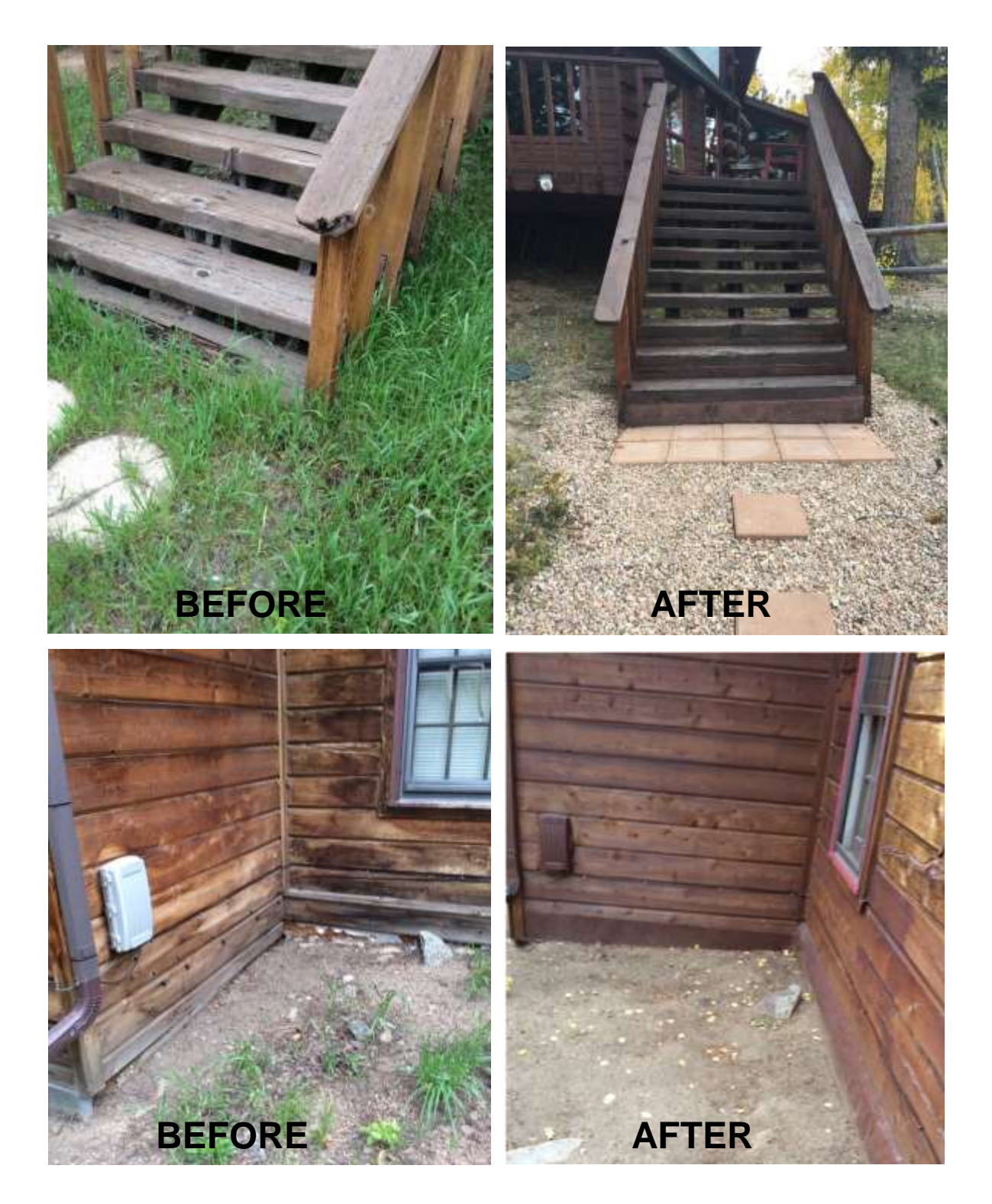
Figure 1. Before/After Mitigation Photos at 141 Sherwood Road (primary structure). Top left: condition of stairs and grass before mitigation (2014); top right: installation of a non-combustible border, repaired and sealed deck boards to eliminate any significant gaps or cracks (2016); bottom left: base of walls without flashing and vegetation (2014); bottom right: non-combustible metal flashing extending several inches from wall base, removal of all vegetation near structure (2016).