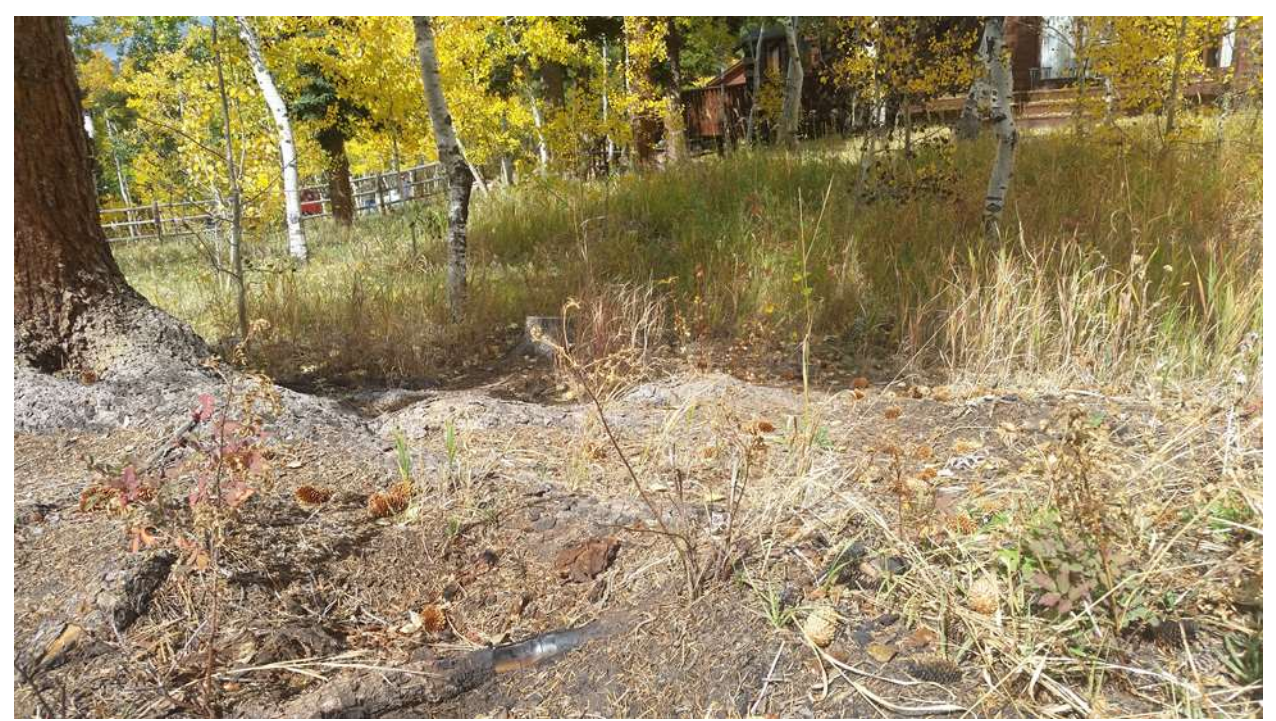
Figure 5. The closest ember ignition evidence to the main structure was at 36 feet to the southwest.